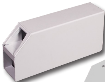
400 OF-A (Open Face - Full Assembly)