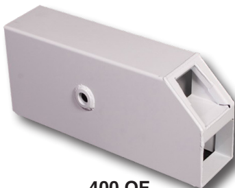
400 OF (Open Face)