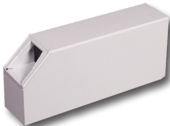
400 CF (Closed Face)