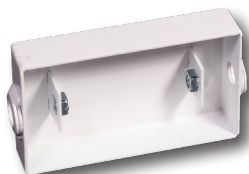
250 DG (Assembly Cover)