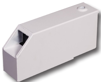
200 OS/CF (Closed Face)