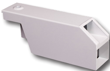
200 OS/OF (Open Face)