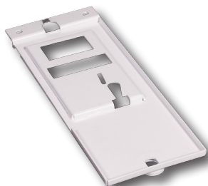
30 LB Tumbler Guard (130 TG)