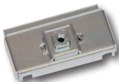
LB 7 (100 LB-7)