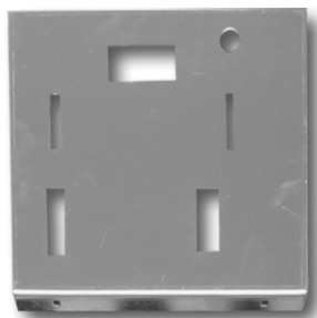
VTM Security Cover (700 SC)