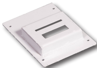
Meter Cover (700 MC)