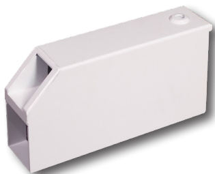
300 OF (Open Face)