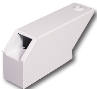
300 CF (Closed Face)